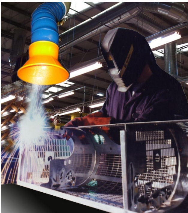
← Stream Vac™ used on manufacturing line to remove welding fumes.

The Stream Vac™ includes a Model 40002 adjustable air amplifier, magnetic base, manual shutoff valve, all attachments and fittings, and three inlet attachments: round nozzle, rectangular nozzle and tapered oval nozzle.